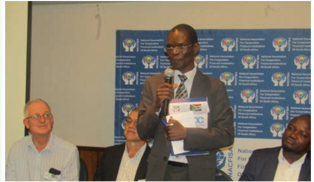
Wizalamu addresses the Southern African Development Community SACCO Managers Forum in 2018.

union/SACCO movement in the country of 15 million people.